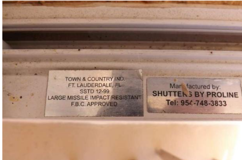
Impact Rated Accordion Shutter Label