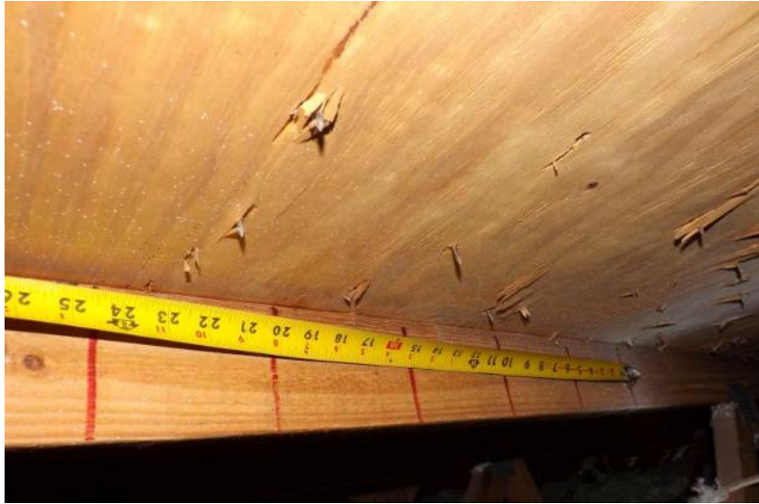
8d Nails Spaced 6" Along the Edge