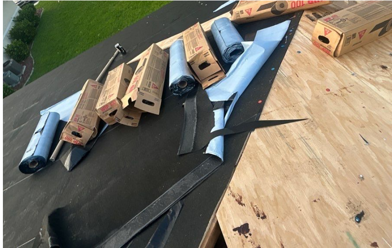
WIP 100 Underlayment