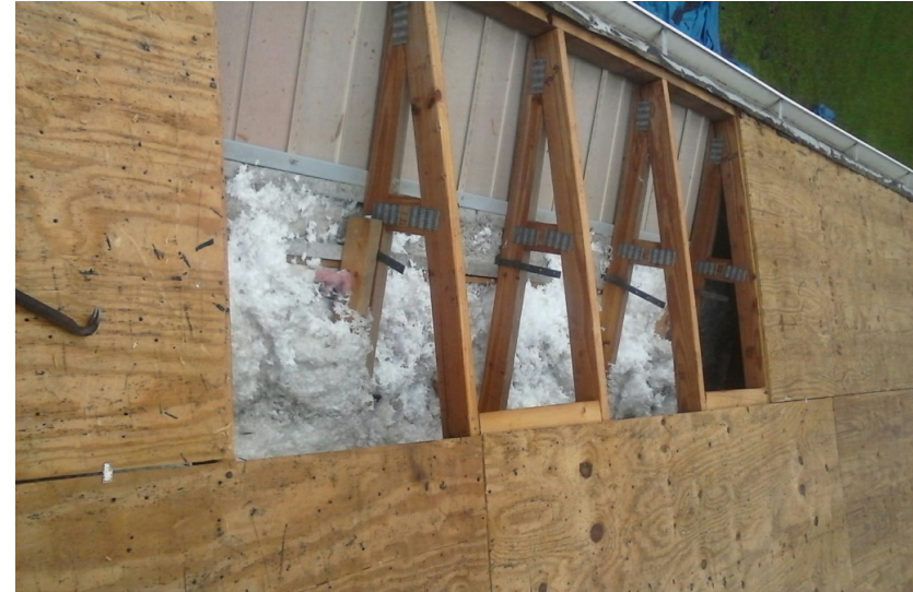
Hurricane Straps on the Trusses