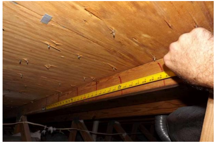
8d Nails Spaced 6" in the Field