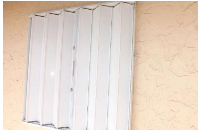
Impact Rated Accordion Shutters