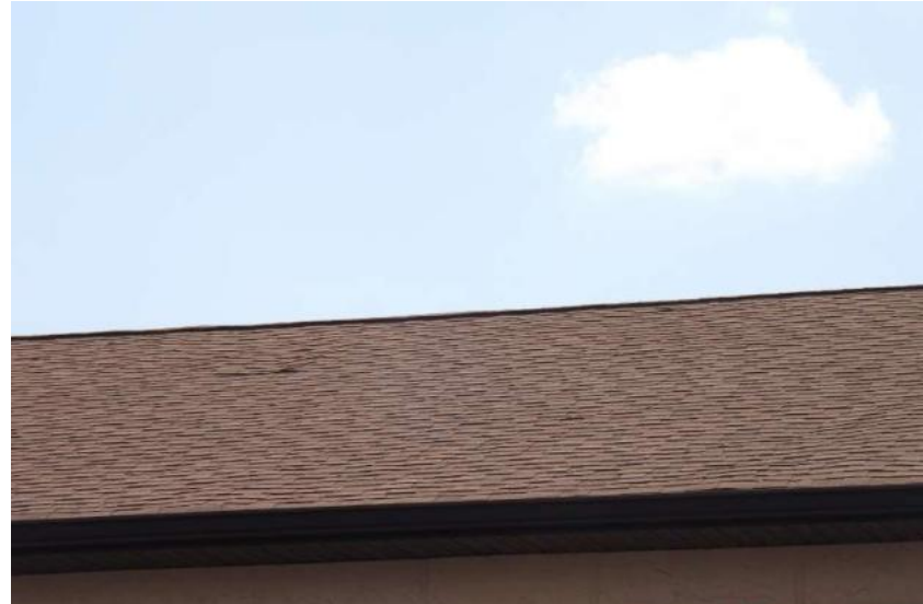
Asphalt/Fiberglass Shingle Roof Covering