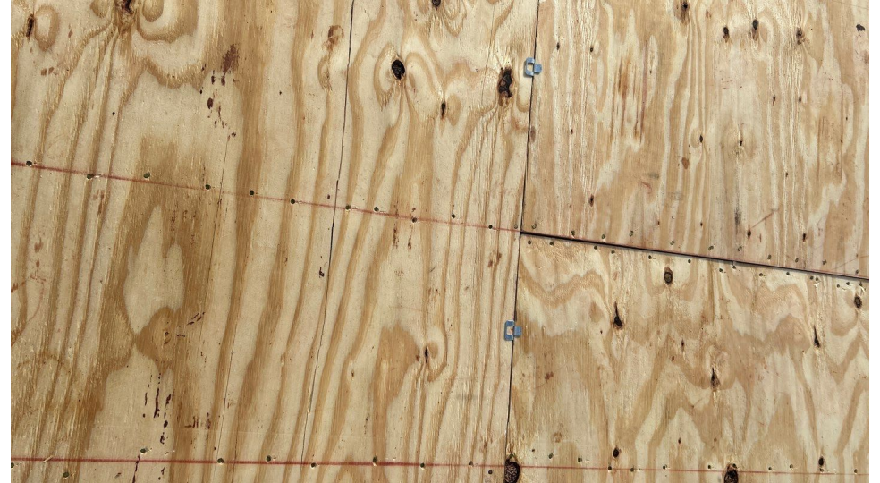
5 8" Deck Thickness