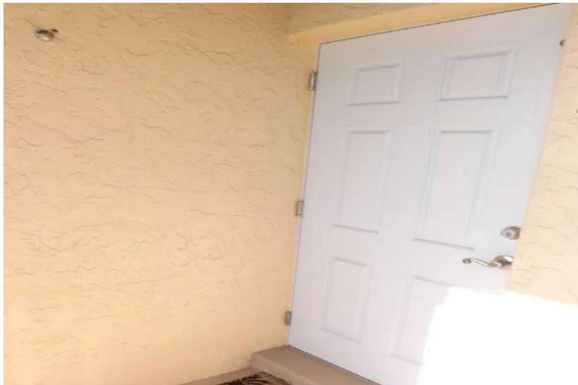
Impact Rated Solid Door - Product Approval FBC2001, FL4085